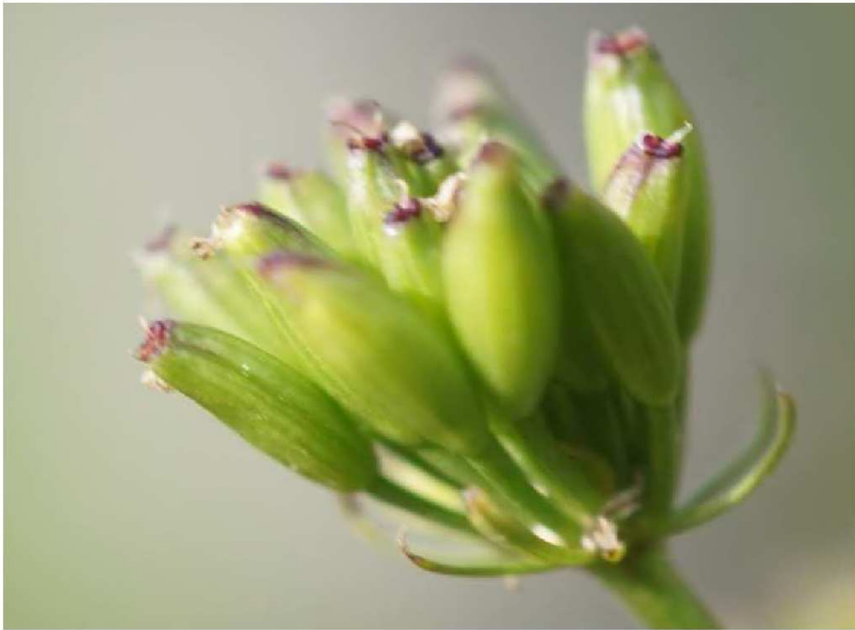
Figure 6. Lomatium knokei maturing inflorescence umbellet. See illustration for typical scale.